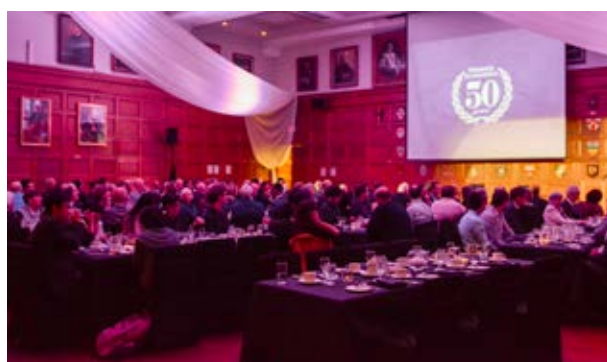
In 2016, the Department of Economics celebrated its 50 th anniversary, welcoming back world-renowned alumni to recognize a tradition of excellence.