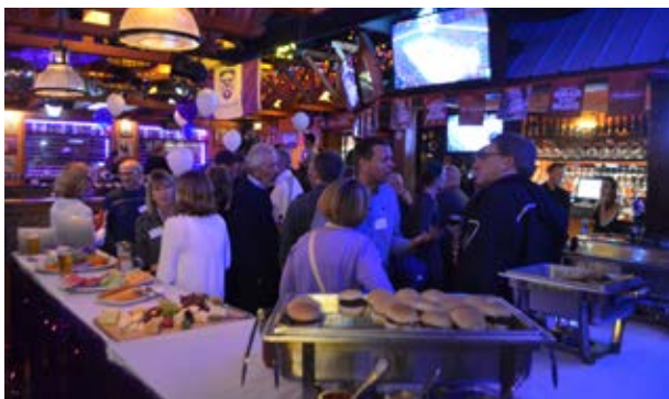
During Homecoming, alumni are invited to “Meet the Dean at the Ceeps”, fostering a continued sense of belonging in the Faculty.