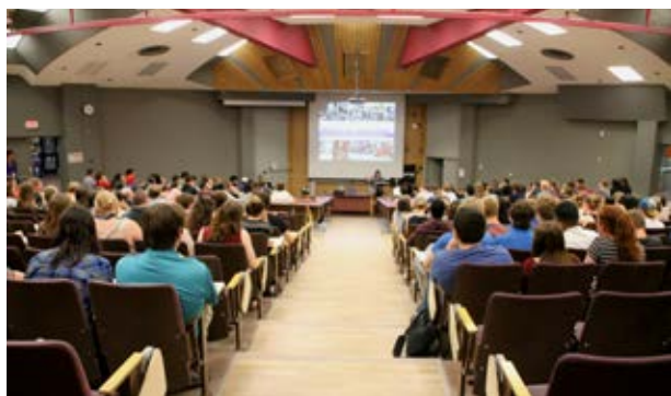
History: It's About Time was a conference for area high school students, held in May 2017, intended to create stronger connections with the community.