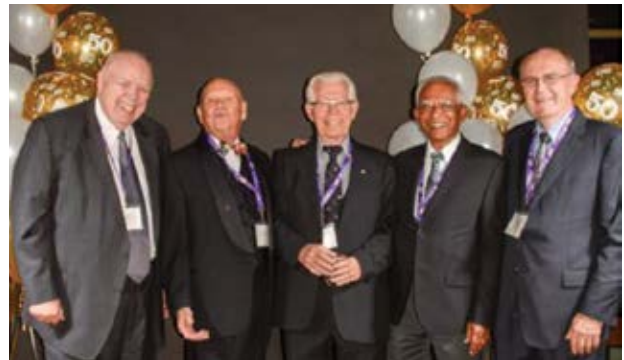
In 2016, the Department of Sociology welcomed back distinguished professors emeriti to celebrate the Department’s 50 th anniversary.